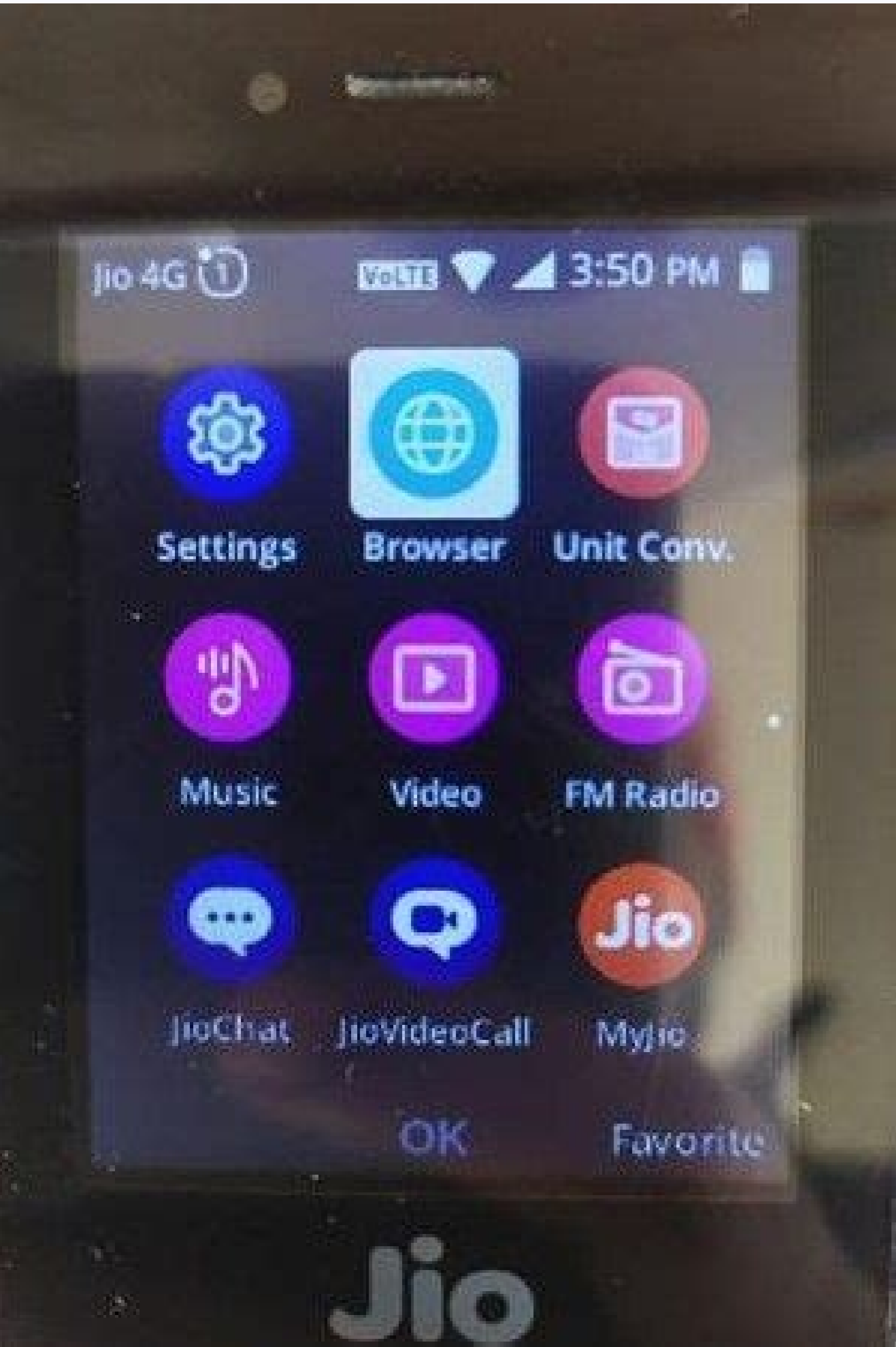
Caller tune video song hd 1080p download. Caller tune full hd video song download 1080p.